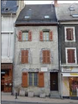
Birthplace of Peter Julian Eymard, La Mure d'Isère, France

Follow the Associates program and the Life in the Eucharist movement in Bread Broken and Shared, the Provincial Newsletter.