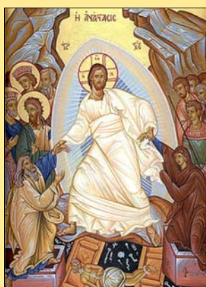
Christ is risen, creator of all!

“We are called to live an authentically Eucharistic Christian spirituality, and we are moved by the spirit of love that led Christ to give his life for the world and to perpetuate this gift in the Eucharist.